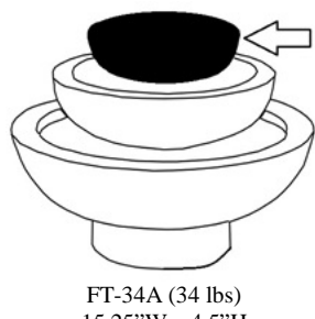
15.25"W x 4.5"H