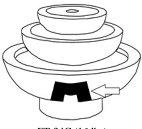
FT-34C (16 lbs) 11"W x 5"H