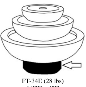
14"W x 4"H

Assemble your fountain on a level surface capable of holding a minimum of 394 pounds with an approximate 1 square foot footprint.